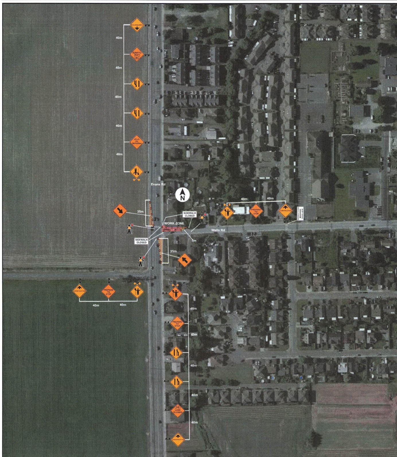
Figure 11.2: Intersection Lane Closure - Two-Lane, Two-Way Roadway with TCPs (Near Side) - Short and Long Duration. TCPs on site to assist with vehicles, pedestrians, bicyclists and all others.