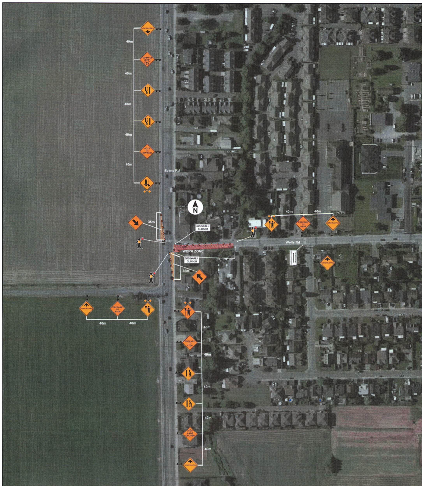
Figure 11.2: Intersection Lane Closure - Two-Lane, Two-Way Roadway with TCPs (Near Side) - Short and Long Duration. TCPs on site to assist with vehicles, pedestrians, bicyclists and all others.