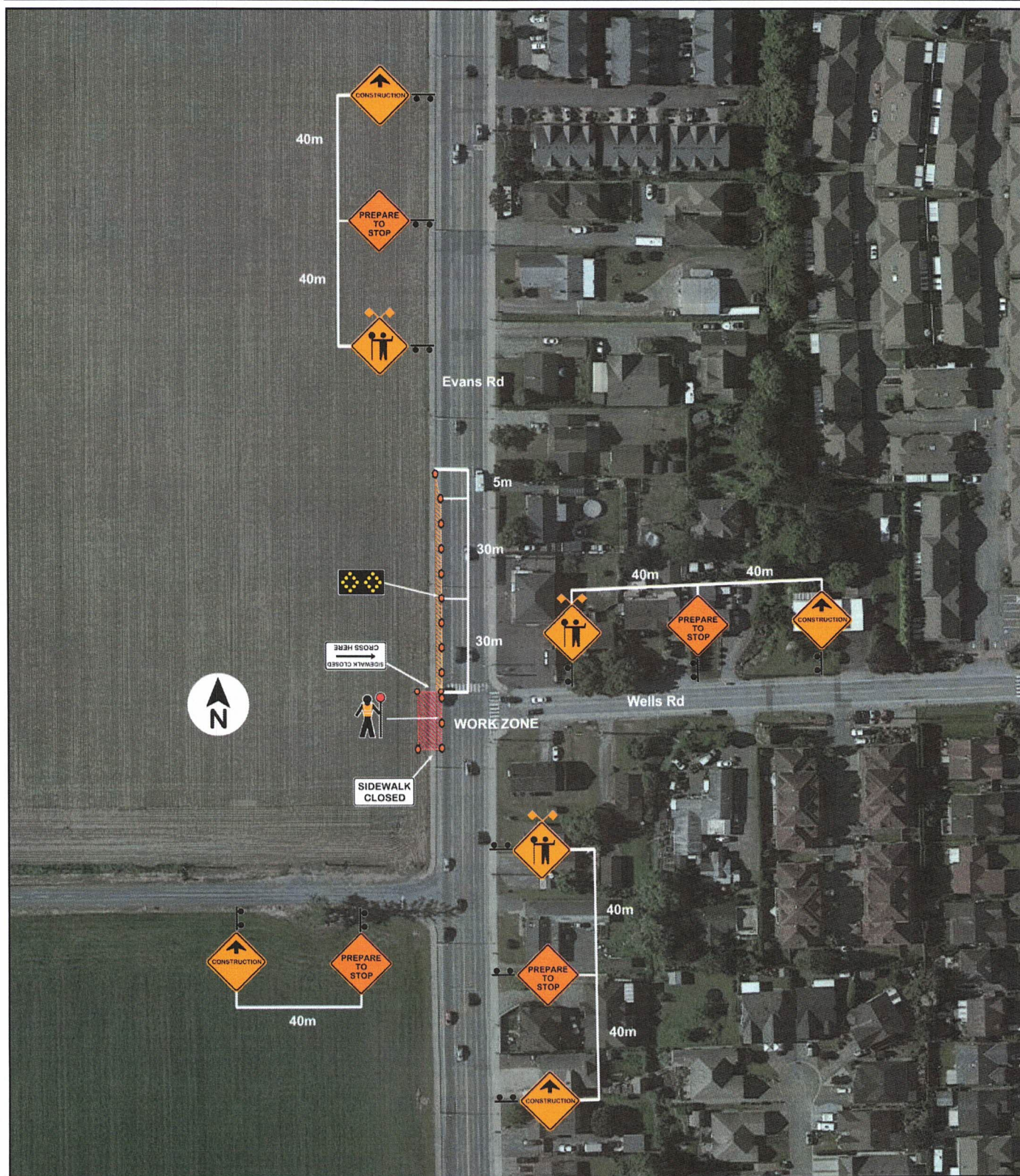
Figure 11.12: Two-Lane Closure - Multilane Intersection - Short and Long Duration TCPs on site to assist with vehicles, pedestrians, bicyclists and all others.