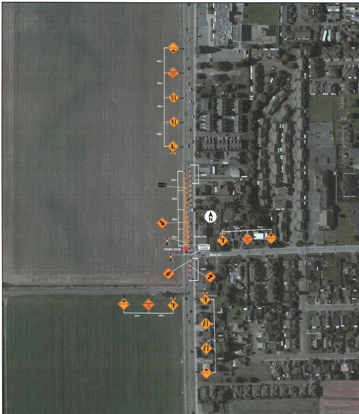
Figure 11.12: Two-Lane Closure - Multilane Intersection - Short and Long Duration TCPs on site to assist with vehicles, pedestrians, bicyclists and all others.